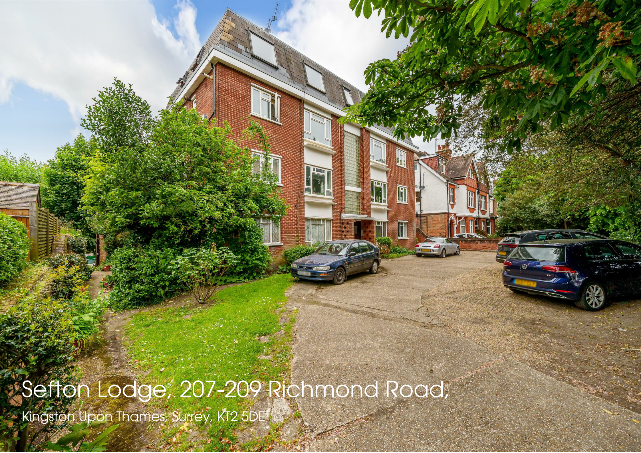
Sefton Lodge, 207-209 Richmond Road, Kingston Upon Thames, Surrey, KT2 5DE